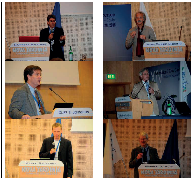
Figure 1: Set of photos of plenary lectures during 14 ICC.

Mineralogy, l'Eau, les Glaces et l'Activité). The formation of favorable acceptor-donor complexes between cation and dioxin molecule in the smectite interlayers was discussed by Cliff T. Johnston (Purdue University, USA). The possibility of carbon dioxide capture and sequestration in deep geological formations for reducing greenhouse emissions was the topic of David R. Cole's lecture (Oak Ridge National Laboratory, USA). The fifth lecture –the Bradley Award- entitled “One-dimensional structure of exfoliated polymer-layered silicate nanocomposite: a polyvinylpyrrolidone (PVP) case study” was presented by Marek Szczerba (Polish Academy of Sciences, Poland). At the last plenary lecture, Warren D. Huff (University of Cincinnati, USA) presented a survey of the history of development of the studies of mudstones since 1556.