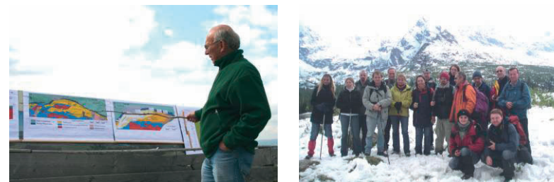
Figure 6: Selected photos from 4 th MECC, Zakopane, Poland.

various rocks, soils and weathering features, notwithstanding that all were covered in snow. The reader may judge from the photos the relative degrees of comfort and enjoyment experienced by the excursion participants (Fig. 6).